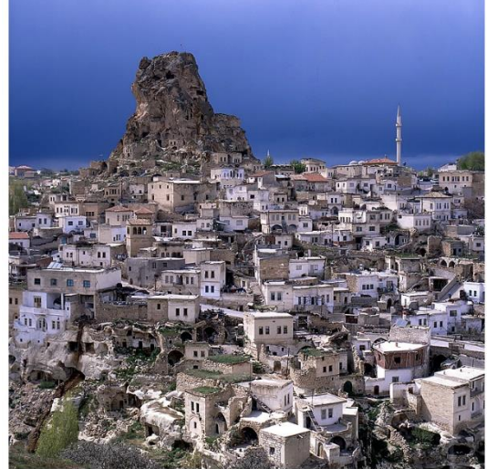
Then continue to visit one of the Underground City

made to accommodate several thousands of people with seven subterranean floors. So far 36 underground cities have been discovered some of them being very recent. It is also estimated that most of them are connected to each other. But it is difficult to identify these connections. After lunch visit Cavusin village , a Greek town whose history goes back to the Early Christian Period. The rock cut buildings have collapsed because of erosion but the churches are still in place and being used as dovecotes.